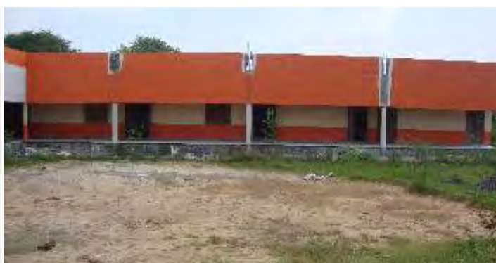
School building at Jagnathapuram in Tiruvallur District partial funding by TNF US Board