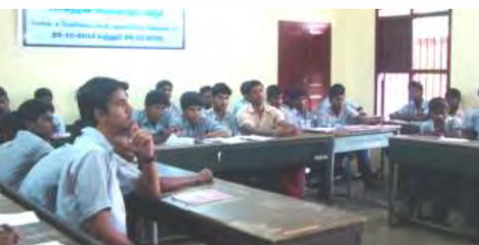
Training session at Chennai High School, Choolaimedu