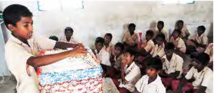
ABC-Academic Bridge Course is conducted for the slow learners of class 6 to 9 to cope with their regular syllabus.

Special Coaching Center - Special focus given to class 10 students. Teachers are available to give extra coaching and clarify the doubts of the students. This also provides space for the students to study after school hours which are otherwise not possible for them