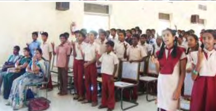
Training at Sivagangai District Schools