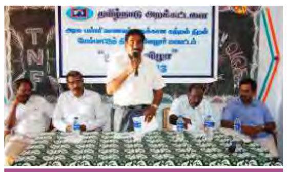
District Education Officer, Vellore Inaugurating the TNF project

District Education Officer, Vellore inaugurated the TNF project. TNF TN Chapter, in association with Directorate of School Education has initiated a project in 5 schools (4 Government High schools and 1 Adi Dravida Welfare Government School) in Arakkonam Taluk. This project includes ABC, Special Coaching Center for class 10 students and soft skill training. Supplementary Nutrition is also provided to the students attending the special coaching