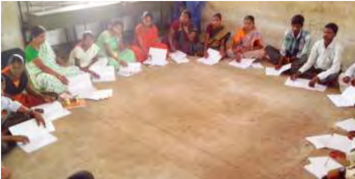
Students during the Launch of the Project