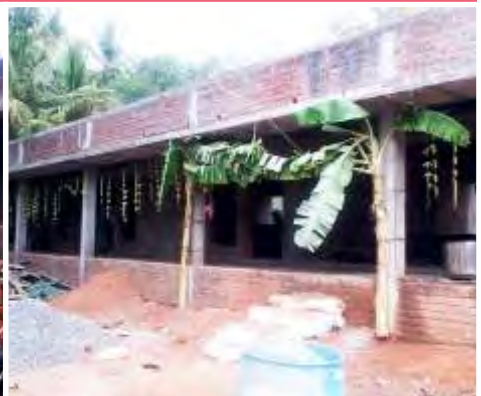
Construction under progress

TNF is providing financial support for construction of 'Subramaniya Chettiyar Gurukulam Higher Secondary School' building with science laboratory for students of class 11 and 12 at Amaravathi Pudur