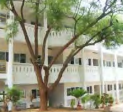
TNF-USA has extended partial funding for the functioning of the Community Radio Station in their School Campus.